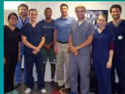
Central Illinois Component