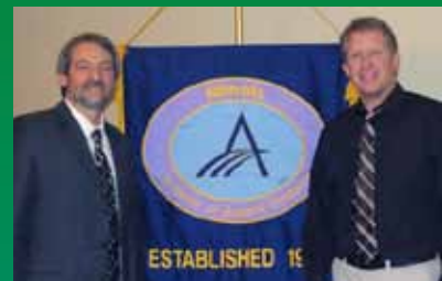
Northern Illinois Component